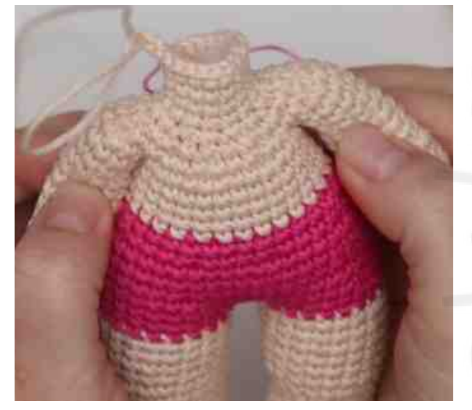
R45: FLO 16inc (32) https://youtu.be/lb40rQgEJys