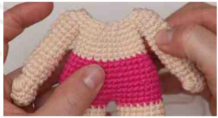
Note: Fill each shoulder very well, but in the center keep it with little filling

R38: (2sc, 1dec)x12 (36) R39: (1sc, 1dec)x12 (24) R40: (1sc, 1dec)x8 (16) https://youtu.be/lb40rQqEJys