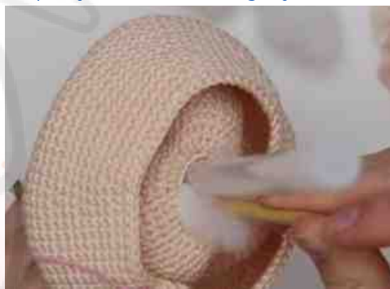
Note: Place padding in the neck around the silicone or support you have chosen.